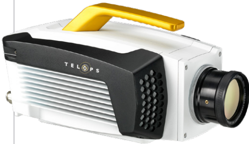
The IP-67 certified enclosure