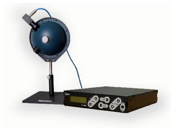
LASER POWER MEASUREMENT SYSTEM

Each system consists of a laser power measurement sphere, post, post holder and base assembly, a detector assembly, SC 6000 programmable radiometer/photometer and multi-wavelength calibration. A second detector port gives the user the flexibility to add an additional detector assembly for broader spectral sensitivity, or add a spectrometer for spectral characterization.